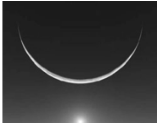
Fig. 6 c. Quarter moon

dance, rituals, story-telling and communication of points of order. In the 20th century the talking drums have become a part of popular music in West Africa, especially in the music genres of Jùjú (Nigeria) and Mbalax (Senegal) (Fig. 7 a, b).