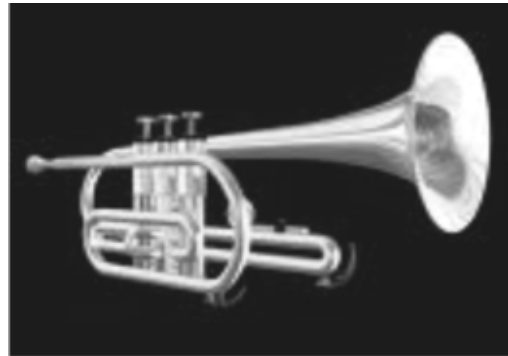
Fig. 7 d. Modern trumpet

named “Sango” sent two slaves to a distant country on an important mission. In due course they returned, and he found that one slave had achieved successfully what he had been sent to do, while the other had accomplished nothing. The King, therefore, rewarded the first with high honors, and commanded the second to receive a hundred and twenty-two (122) razor cuts all over his body (Fig. 8).