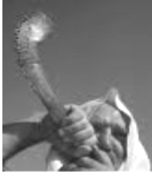
Fig. 7 c. Traditional trumpet

According to http://www.sacred-texts.com/afr/yl/y104.htm , the story of how tribal marks came to be used started when a certain King