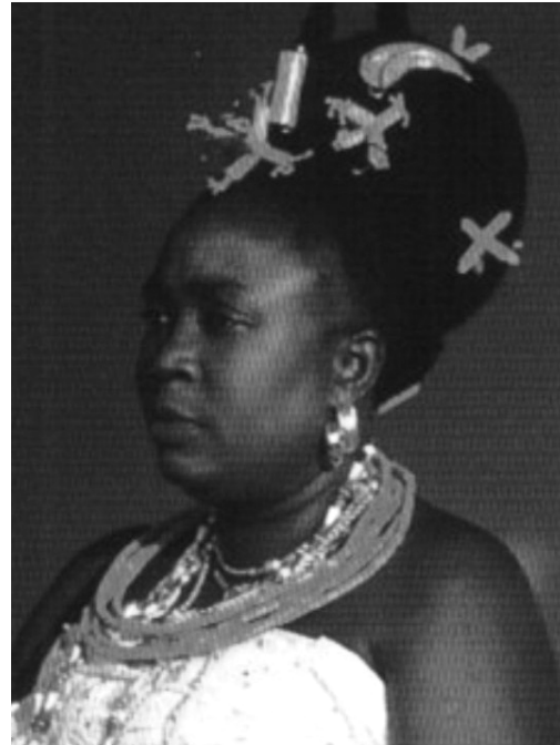
Fig. 3 a. Female hairstyle

Not too long ago in the south west, south-south and south eastern part of Nigeria, threading the hair with black cotton thread was in vogue. The hair is parted into small portions and threaded all the way to form a beautiful pattern. Today, woolen threads of various colours are now used by young women (Fig. 3a, b, c).