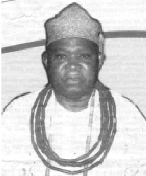
Fig. 1a. Traditional beads