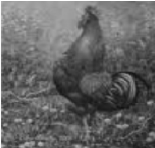
Fig. 2b. Cock crow

ing Edo women. The right to wear a coral-bead crown is limited to the Oba, the queen mother, and the Ezomo , the Oba's principal war chief, and thus conveys the queen mother's importance in the Benin political hierarchy.