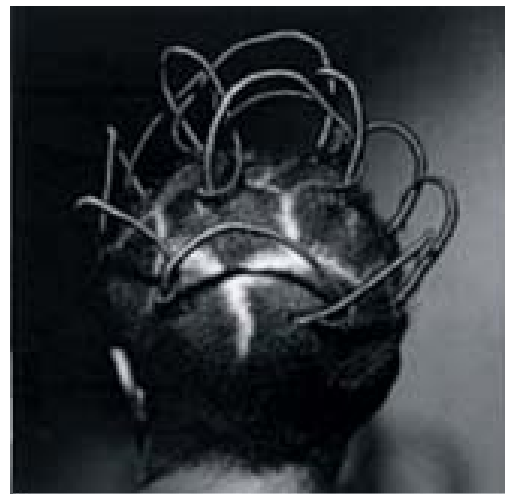
Fig. 3 b. Female hairstyle