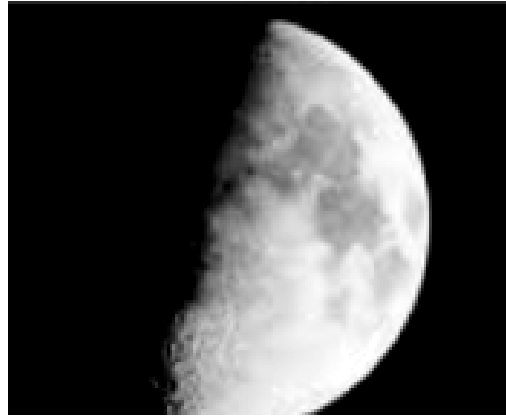
Fig. 6 b. Half moon

According to Wikipedia (Talking drum in the African context, Nov. 9, 2009) talking drums are developed and used by cultures living in forested areas. Drums served as an early form of long distance communication, and were used during ceremonial and religious functions. There are two types of talking drums: pressure drum and slit gongs. The pressure drum can be modulated quite closely, its range is limited to a gathering or market-place, and it is primarily used in ceremonial settings. Ceremonial functions could include