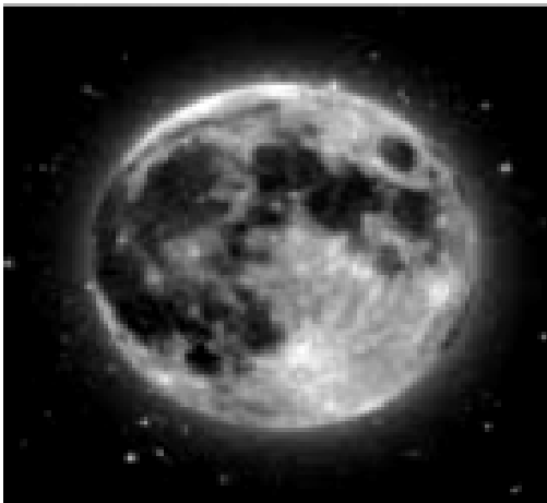
Fig. 6 a. Full moon

The Moon has a long association with insanity and irrationality; the words lunacy and loony are derived from the Latin name for the Moon, Luna . Philosophers such as Aristotle and Pliny the Elder ( http://en.wikipedia.org/wiki/Moon#cite_note-sciam-163 ) argued but admitted that there is no scientific evidence to support such claims, that the full Moon induced insanity in susceptible individuals, believing that the brain, which is mostly water, must be affected by the Moon and its power over the tides, but the Moon's gravity is too slight to affect any single person. Even today, people insist that admissions to psychiatric hospitals, traffic accidents, homicides or suicides increase during a full Moon; again, these philosophers admit that there is no scientific evidence to support such claims (Fig. 6 a, b, c).