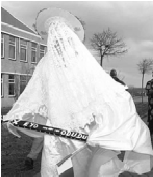
Fig. 5. Masquerades

season, the 1993 Enugu State Mmanwu Festival helped to modernize Igbo masking. Maskers and musicians, dancers and titled men paraded in the afternoon heat and helped shape traditional customs for use in contemporary Nigeria. Since its beginning in 1986, this ongoing urban masquerade festival has expressed both nostalgia for the past and anxiety about the future, and reflected ongoing political, technological, cultural, and economic change. The festival organizers attempted to create a tourist attraction to improve economic conditions by celebrating Igbo masquerade traditions that reflect social and political values. By altering and simulating these traditions, festival organizers worked to present a powerful art that they hoped would bring both moral virtue as well as economic benefits to the state (Fig. 5).