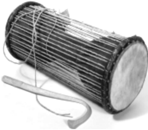
Fig. 7 a. Talking drum