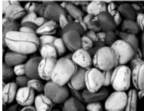
Fig. 4 a. Kolanuts

The presentation of kolanuts is a privilege