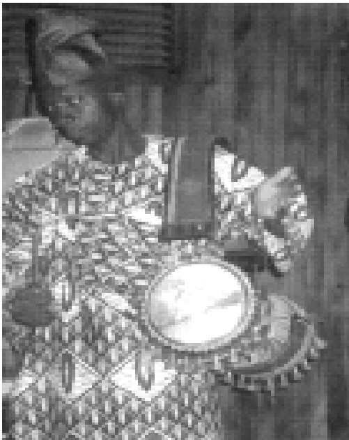
Fig. 7 b. Talking drum

during the slave trade. There they were banned because they were being used by the slaves to communicate over long distances in a code unknown to their enslavers.