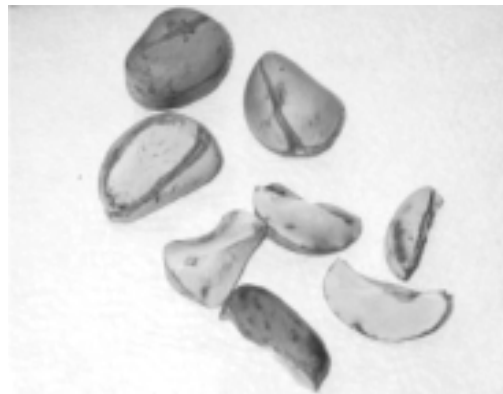
Fig. 4 b. Kolanuts

reserved for the men; this privilege is denied to women for cultural reasons. Kolanut is held by majority of Igbo people to be sacred. Hence women who because of their monthly period are regarded as impure are barred from breaking kolanut in order to avoid its defilement. It is even held that women should not climb a kolanut tree as this could result in the tree going barren. However, women can break kolanut when it is an all women gathering ( http://www.mysticwicks.com/kolanut http://www.kwenu.com/kolanut , www.abibitumikasa.com/kolanut ).