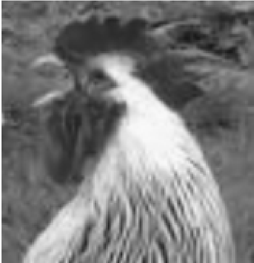
Fig. 2a. Cock crow