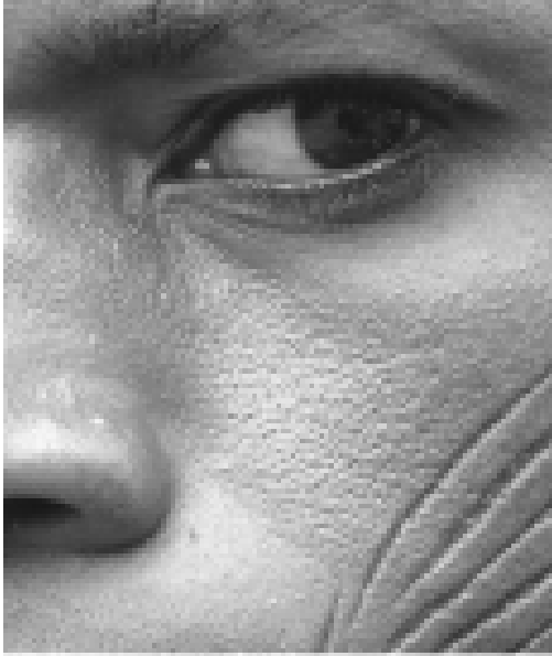
Fig. 8. Tribal marks

ced himself at once in the hands of the markers. However, he could only bear two cuts, and so from that day two cuts on the arm have been the sign of royalty, and various other cuts came to be the marks of different tribes.